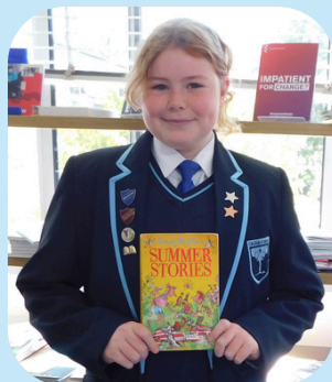
'Summer Stories' by Enid Blyton